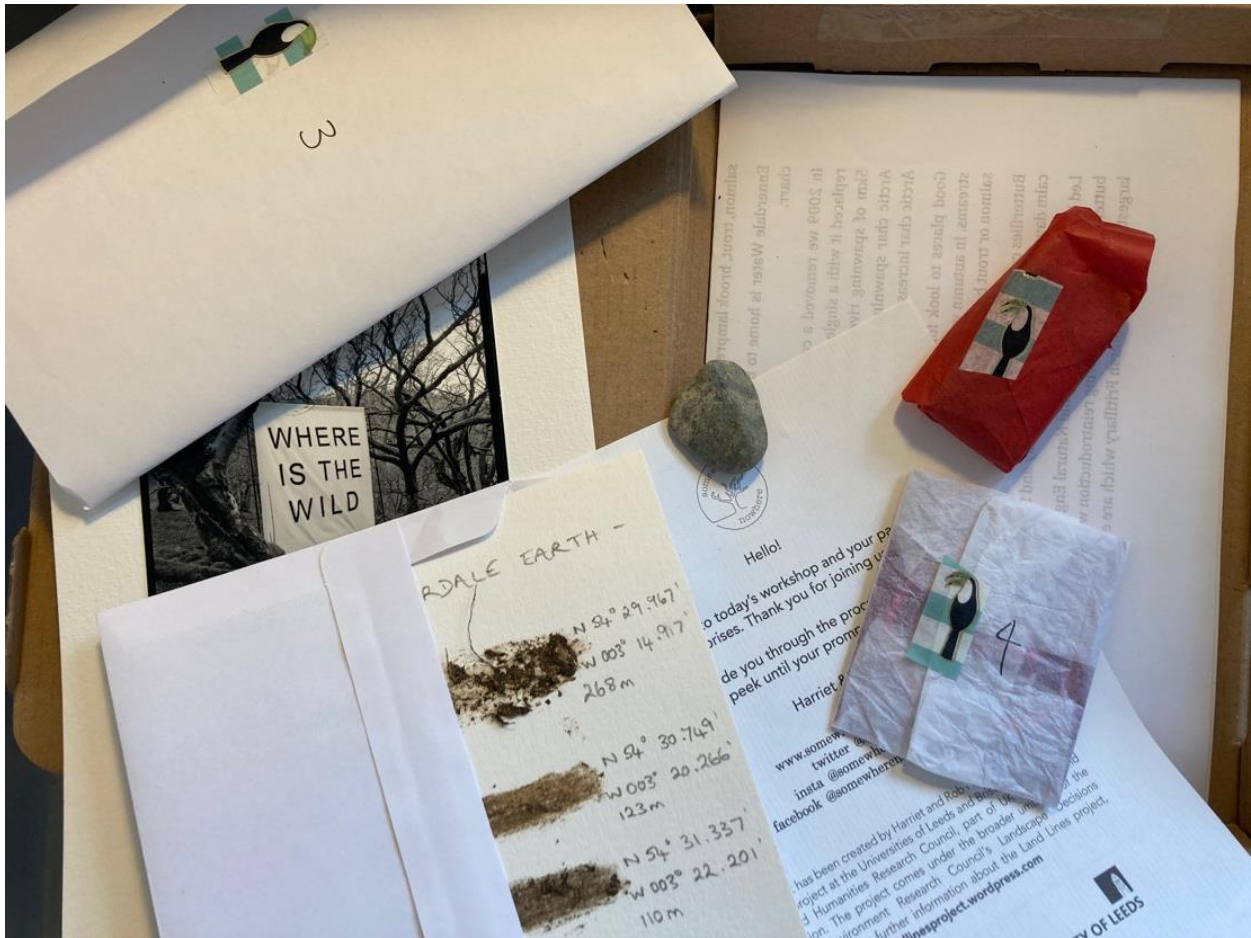
Image 4 - Materials 'box' from the 'ways of seeing, ways of writing' workshop